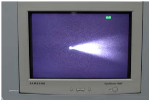
Laser output on monitor