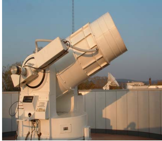
Fig.1. Changchun SLR telescope

Due to the urgent need, it is necessary to select an existing SLR station to provide laser ranging service for GSTB-V2 satellites. Given the importance of SLR data for the characterization of the GIOVE clocks, the People's Republic of China contributed to the Galileo program the refurbishing of a Chinese SLR station to provide GIOVE laser-ranging observations. The Changchun station in northeast China was selected among the Chinese stations contributing to the ILRS because it had demonstrated strong MEO satellite tracking; collocation with an existing International GPS Service station; and good weather conditions. There are 5 fixed SLR stations in China nowadays. Among the stations, Changchun station possesses the best performance. Its data quantity is the most in China. It has the ability to range to the distance more than 20,000km with the accuracy less than 2cm. So Changchun SLR Station is selected to service for Galileo in the early stage. Followings are photos of Changchun station and SLR telescope: