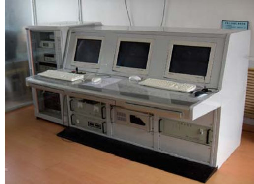
New operation console