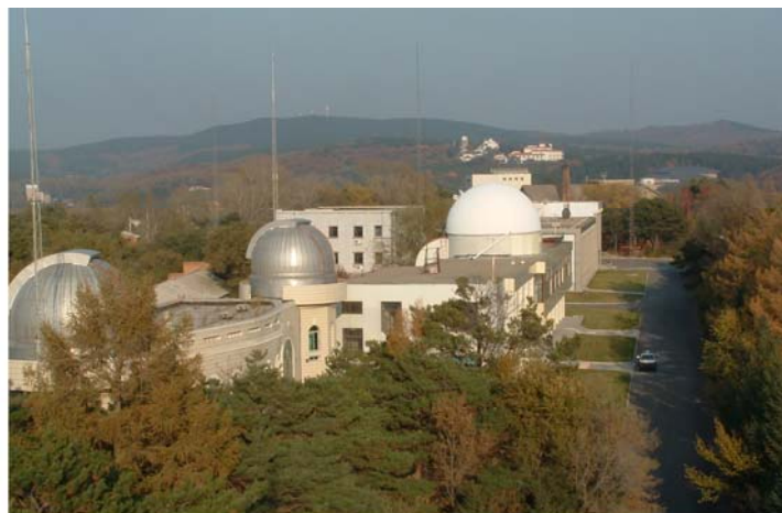
Fig.2. Bird view of Changchun station

Due to the urgent need, it is necessary to select an existing SLR station to provide laser ranging service for GSTB-V2 satellites. Given the importance of SLR data for the characterization of the GIOVE clocks, the People's Republic of China contributed to the Galileo program the refurbishing of a Chinese SLR station to provide GIOVE laser-ranging observations. The Changchun station in northeast China was selected among the Chinese stations contributing to the ILRS because it had demonstrated strong MEO satellite tracking; collocation with an existing International GPS Service station; and good weather conditions. There are 5 fixed SLR stations in China nowadays. Among the stations, Changchun station possesses the best performance. Its data quantity is the most in China. It has the ability to range to the distance more than 20,000km with the accuracy less than 2cm. So Changchun SLR Station is selected to service for Galileo in the early stage. Followings are photos of Changchun station and SLR telescope: