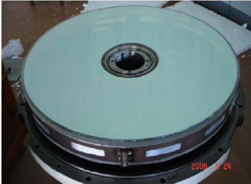
The recoated primary mirror

Following are the photos to show the recoated primary mirror, new operation console, laser output on screen, and the encoder system.