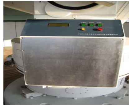
New encoder system

Up to Dec.12 of 2006, there are 28 passes of GIOVE-A and 12 passes of GPS-35, -36 to be tracked. Refurbishing work had been finished and acceptance tests were underway. The observations performed by Changchun at the time of the campaign were included in the data set as the data revealed itself to be of high value for the analysis carried out. The geographical location of Changchun (see Figures 4) was of primary importance in providing better laser-ranging coverage of GIOVE-A.