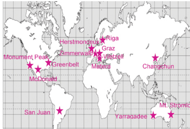
Fig.4. World map showing geographical distribution of the first GIOVE-A ranging campaign